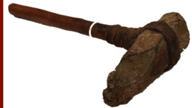
quarry pick, Smithsonian Collection

In the month of April, the Palisades Museum of Prehistory will be sponsoring primitive technology demonstrations. Artists will manufacture spearpoints and pottery in the style of Palisadian Indians. People wanting to participate in these activities are encouraged to contact the museum before March 27.